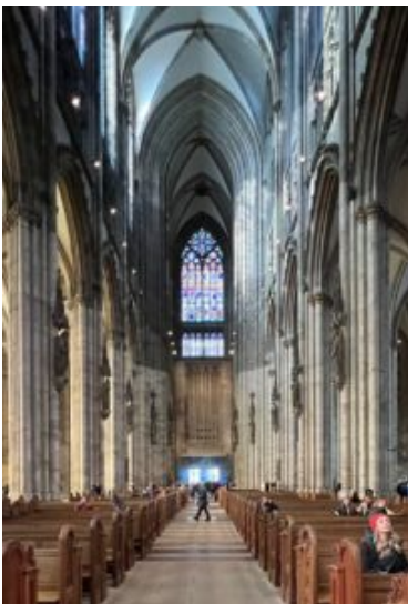
Interior view of Cologne Cathedral towards the west entrance