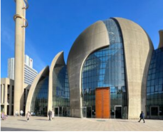
DiTiB Central Mosque Cologne, Design by Paul Böhm architects, 2006 – 2017 © Pieter van der Ree