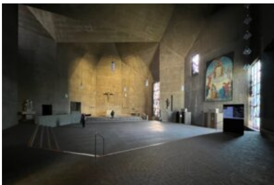
Interior view of St Gertrud Church towards the altar © Pieter van der Ree