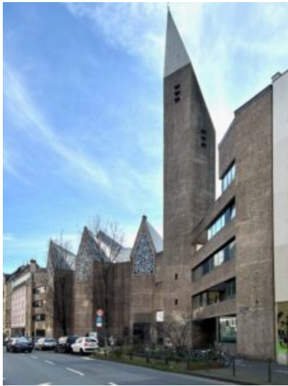
St Gertrude's Church, Design by Gottfried Böhm, 1960 – 1965 © Pieter van der Ree

value of the sacred again.' Was this perhaps the inner reason for the ambivalence of the room that we felt here? However, we were puzzled as to how it is possible for such an inner attitude to be reflected in the architectural design and still be experienced decades later and cause problems for visitors. In the meantime, as posters testify, the church management is also looking for an extended purpose for the church as a cultural space.