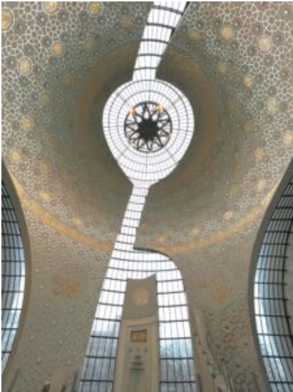
Light opening in the dome of DiTiB Central Mosque Cologne