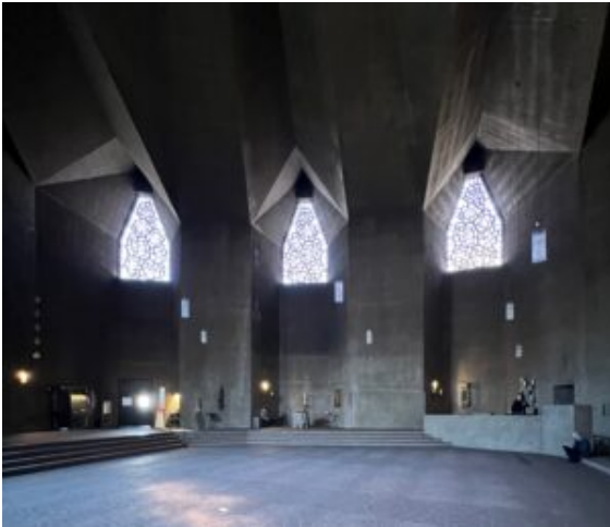
Interior view of St Gertrud Church North facade © Pieter van der Ree