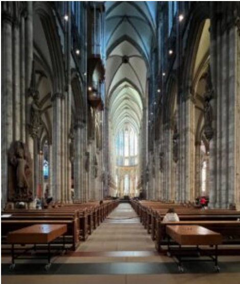
Interior view of Cologne Cathedral towards the choir

leads up to the light when looking towards the east, above the altar, works in the opposite direction towards the west. There, before leaving the cathedral, the mighty bundles of pillars bring visitors back down to earth with their two legs.