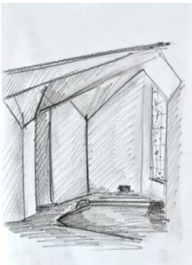
Drawing of the architectural gestures of St Gertrude's