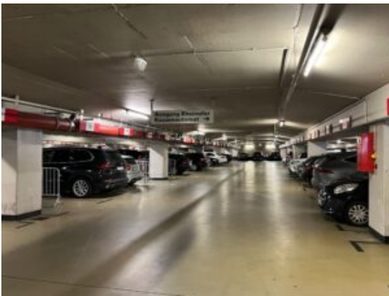
Room atmosphere Cologne multi-storey car park

that went beyond purely functional purpose fulfilment. Their narrowness, lowliness and dirtiness gave them all a somewhat eerie atmosphere. You would never think of staying there, but would want to leave the space as soon as the car was parked and only return when you wanted to drive out. Once we were up there in the sunshine and the cathedral was shining brightly in front of us, we breathed a sigh of relief and realised how beneficial the fresh air and warm sunlight were. However, it was an interesting preparation for our excursion to realise how rooms can be 'deprived' and 'enriched' by natural elements such as daylight and spiritual qualities.