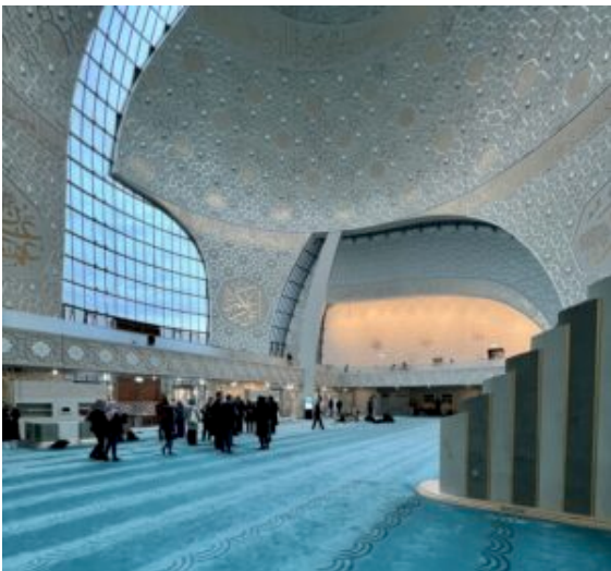
Interior view of DiTiB Central Mosque Cologne