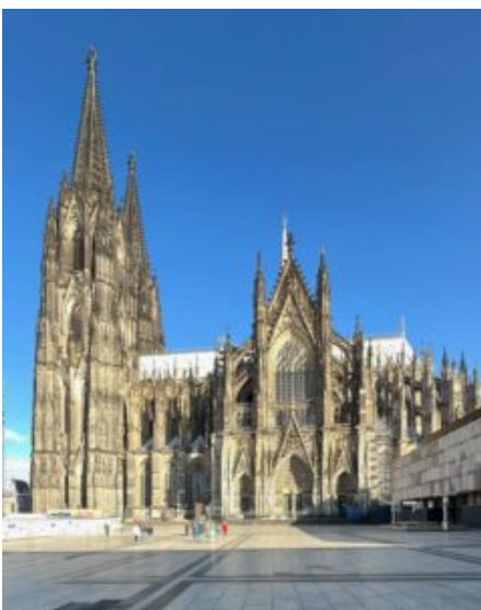
Cologne Cathedral from the south © Pieter van der Ree