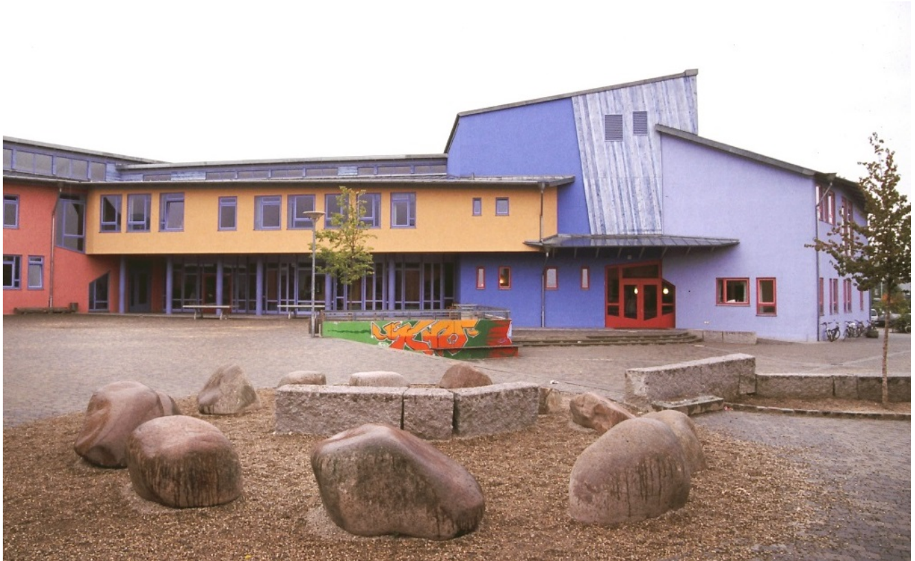
Winfried Reindl (Portus Bau) – Waldorf School, Offenburg, Germany

These brief references to features of the period are only small examples to illustrate the approach outlined. I am convinced that an important task of organic architects today is to delve more and more into understanding the developments of society and to engage in a kind of exploratory conversation with each other on the subject, in order to complement the different points of view and perceptions. This can form a basis in terms of content and ideas for a joint effort in the modern world.