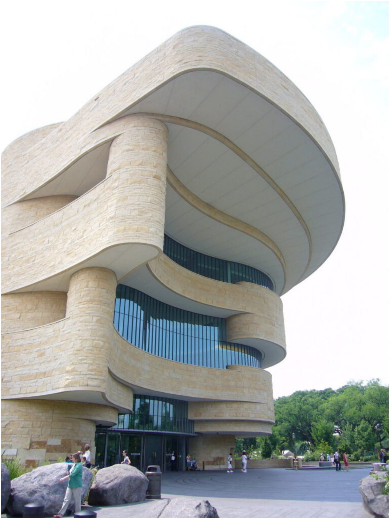
D. Cardinal – National Museum of American Indian, Washington DC, USA, 2004