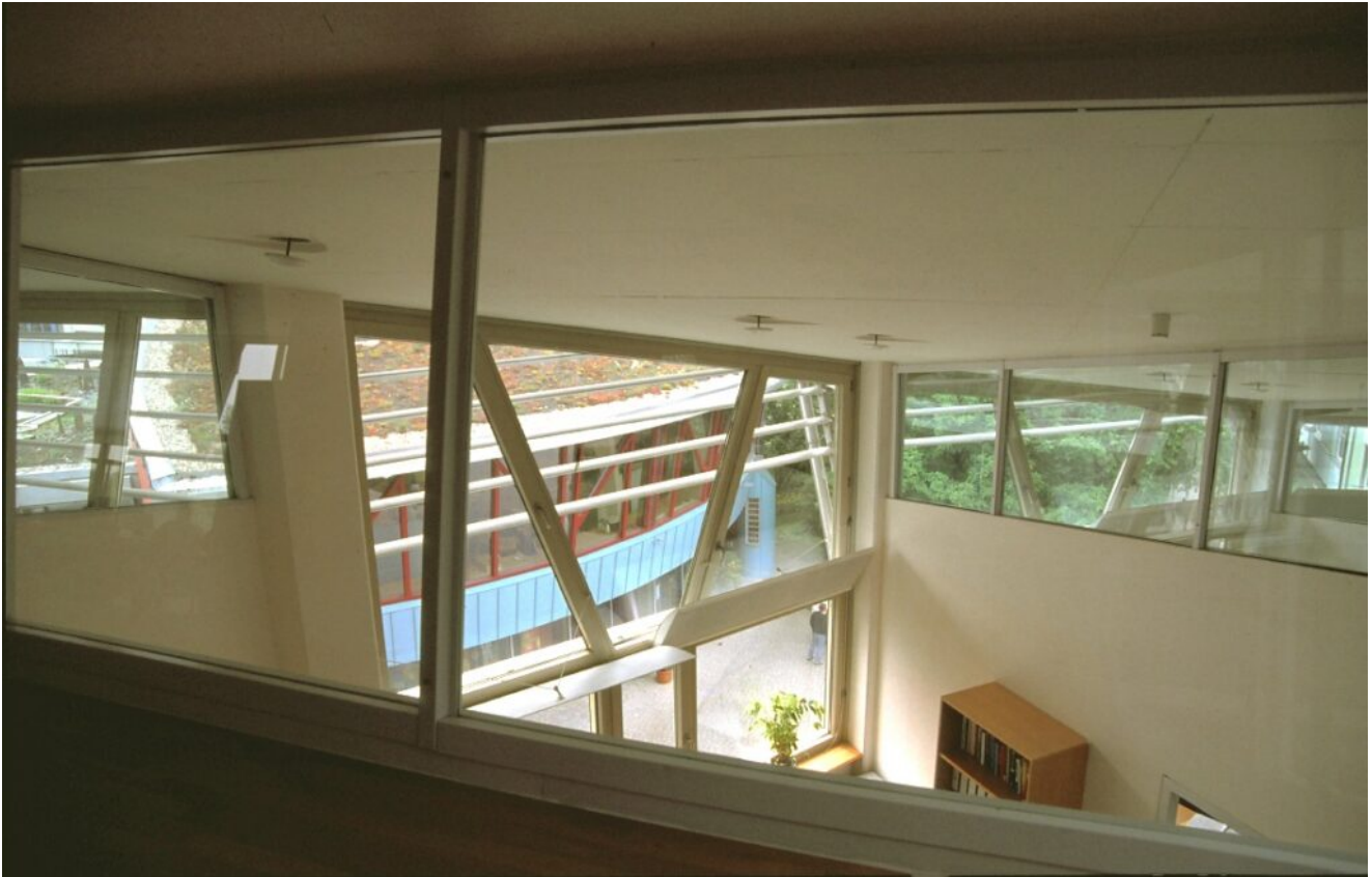
BPR – Weleda Headquarters. Schwäbisch Gmünd, Germany