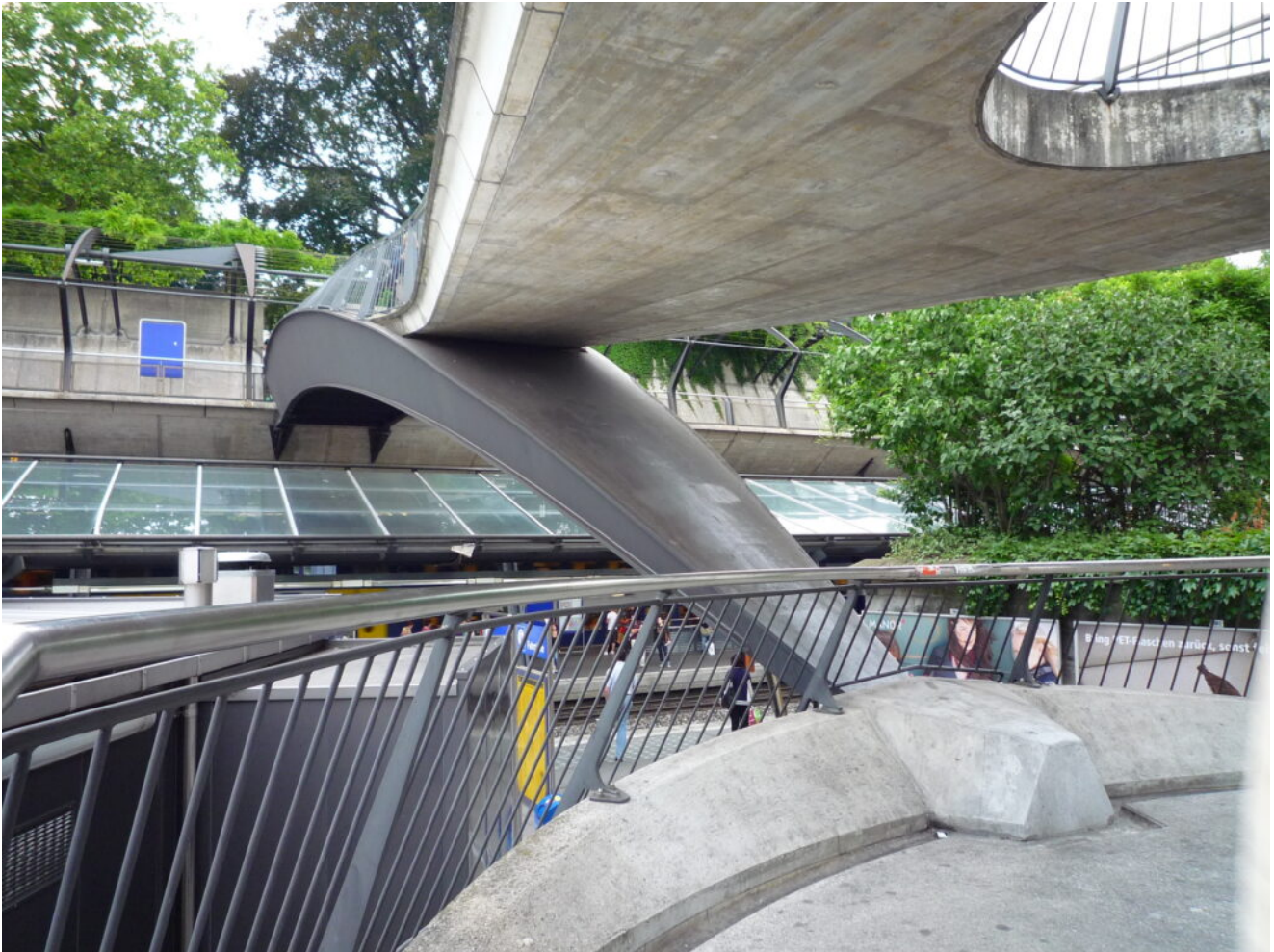
S. Calatrava – Stadelhofen station, Zurich, Switzerland, 1990