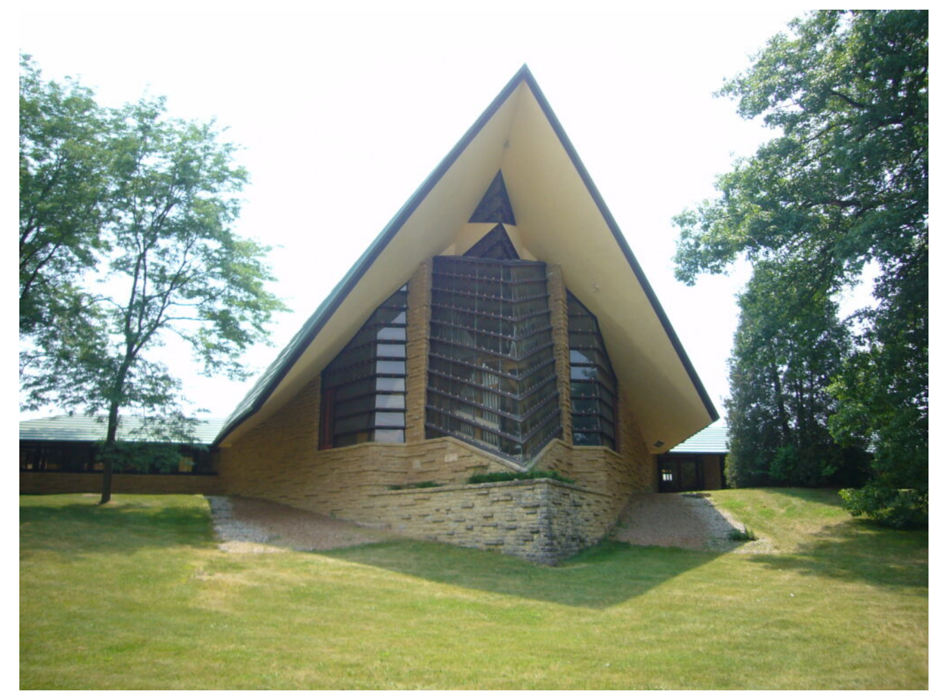
Frank Lloyd Wright – Unitarian Church, Madison (WI – USA), 1949

Frank-Lloyd Wright (1869–1959) broadened both the content and the language of organic architecture in many directions. He expanded the concept 'organic' to denote the relation between the building and its environment, the continuity of internal and external space and the use of building materials in accordance with their own nature.